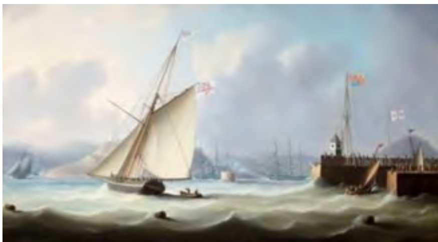
Detail from The Arrival of George IV at Leith Harbour, 1822 - Thomas Buttersworth

The Artist & the Sea explores these themes and their interpretation by different artists. Selected from the City Art Centre's collection of historic and contemporary Scottish art, the exhibition contains examples of painting, drawing, printmaking and sculpture. Featured artists include John Bellany, William McTaggart, and Joan Eardley.