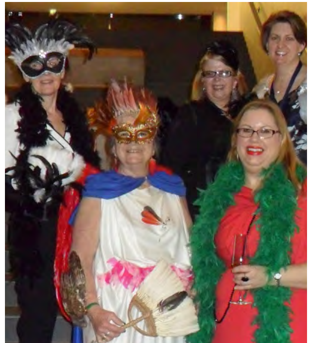
Fancy Dress Charity Auction Dinner