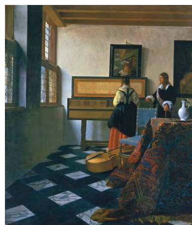
Vermeer, Lady at the Virginals with a Gentleman

Coffee Plusers – mark your diaries now for our June visit, which will be on Saturday, 18 June, when we will visit Holyrood Palace to view their exhibition of the Queen's dresses. Details will be in a later Newsletter. Families and friends are welcome to join us.