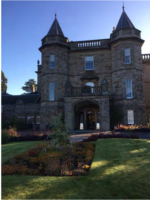
Entrance to the Dalmahoy Hotel through the Baronial House built in the 1720s, to the design of William Adam, for George Dalrymple, youngest son of the Earl of Stair