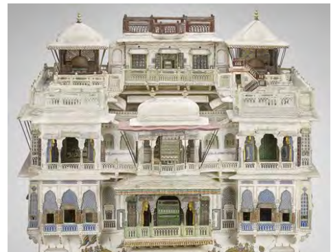
Model of a Jaipur house

The venue for Wednesday, 28 March, is yet to be decided. Put the date in your diary and check the Monthly Reminder or phone me for further details.